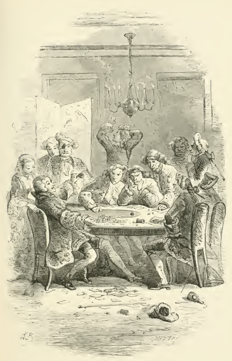
A NIGHT AT THE GROOM PORTER'S